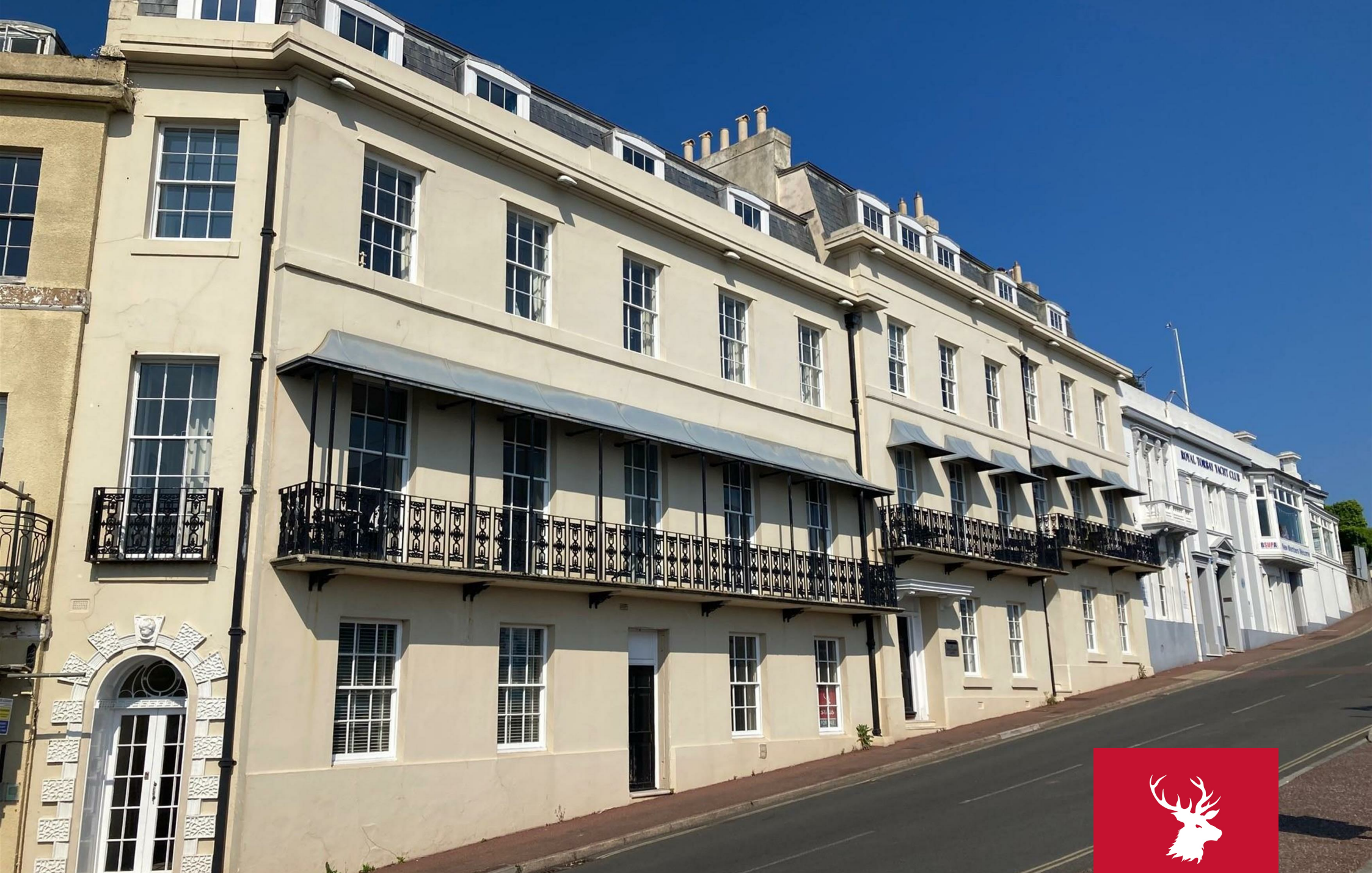
Flat 1, Royal Marina Court,